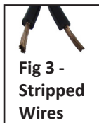
Fig 3 - Stripped Wires

4. Connect the end of the 50 foot 12-2 Cable that has the installed Electrical Connectors to the Power Transformer. If the Power Transformer electrical Tabs have screws and hardware attached, remove and discard. See Fig 4.