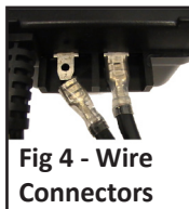
Fig 4 - Wire Connectors

6. Using the included Wire Nuts (see Fig 5), connect each wire from the end of the 50 foot 12-2 Cable (stripped in step 3) to each wire on the Flagpole Light Fixture.